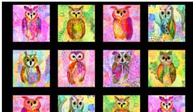
MAJO 164 MU*

Fabric Collection by KD Art Studio for P&B Textiles