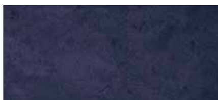
SUE6 302 DN*