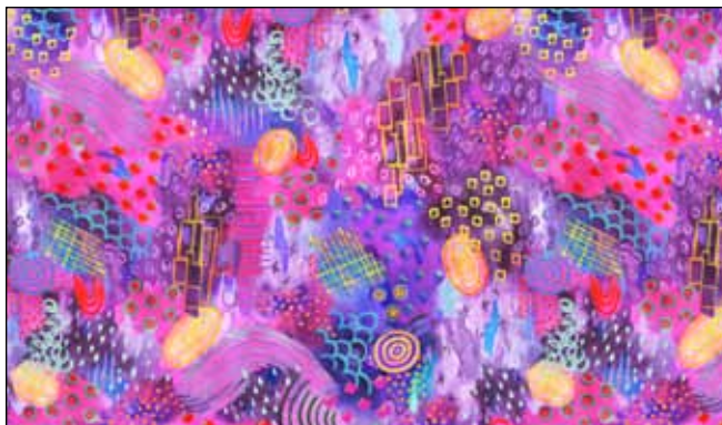
MAJO 165 MU*