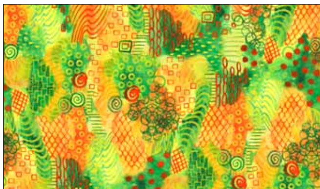
MAJO 166 MU*