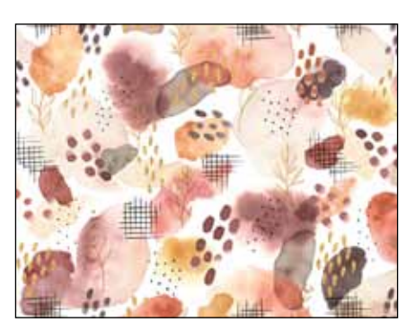
DBLO 5210 W*