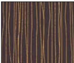
DBLO 5218 DST*