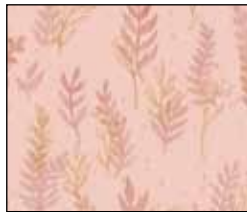
DBLO 5215 LP