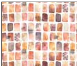
DBLO 5211 W