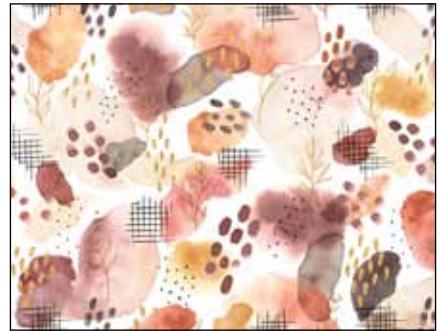
DBLO 5210 W*