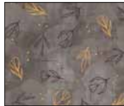
DBLO 5216 S