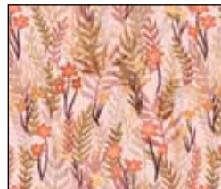
DBLO 5213 LC