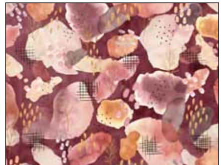
DBLO 5210 CC