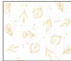
DBLO 5216 W