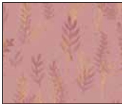
DBLO 5215 C