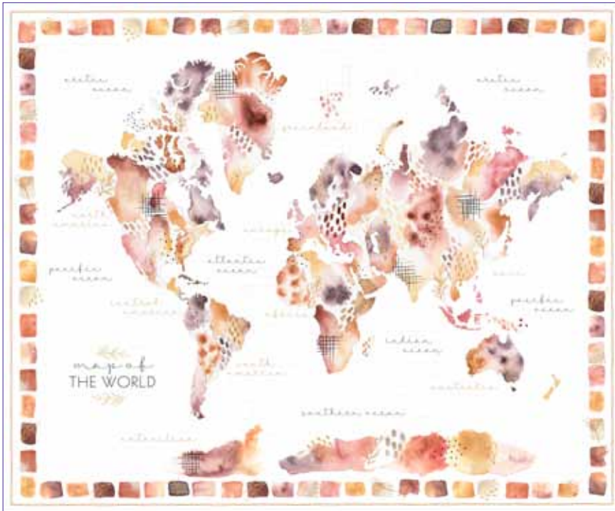
DBLO 5209 PA*