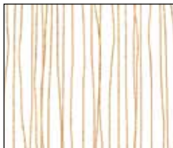
DBLO 5218 W