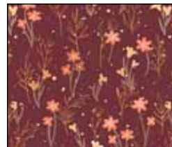
DBLO 5214 CC*