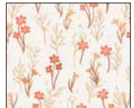
DBLO 5214 E†