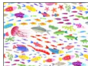
DBSE 4837 MU*