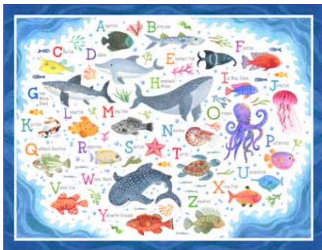
DBSE 4832 PA