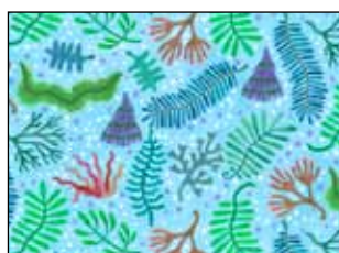
DBSE 4835 B