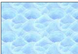
DBSE 4839 LB