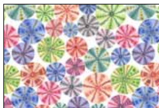
DBSE 4838 MU