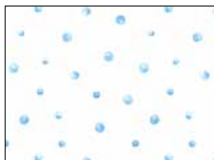
DBSE 4836 LB