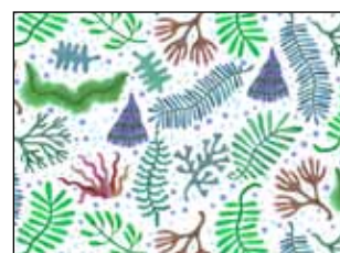
DBSE 4835 MU