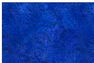
SERE 4492 BV*