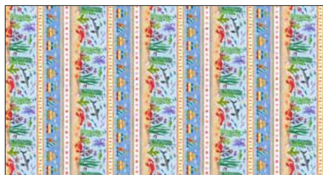
DBSE 4834 MU