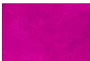
SUEB 300 F*