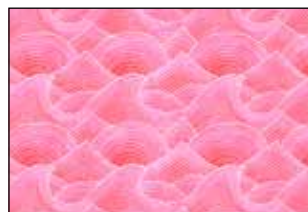
DBSE 4839 P