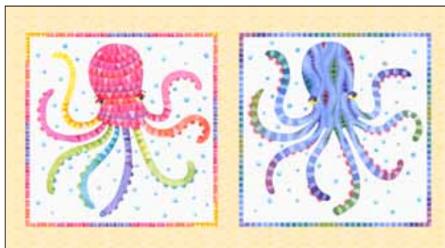
DBSE 4833 PA*