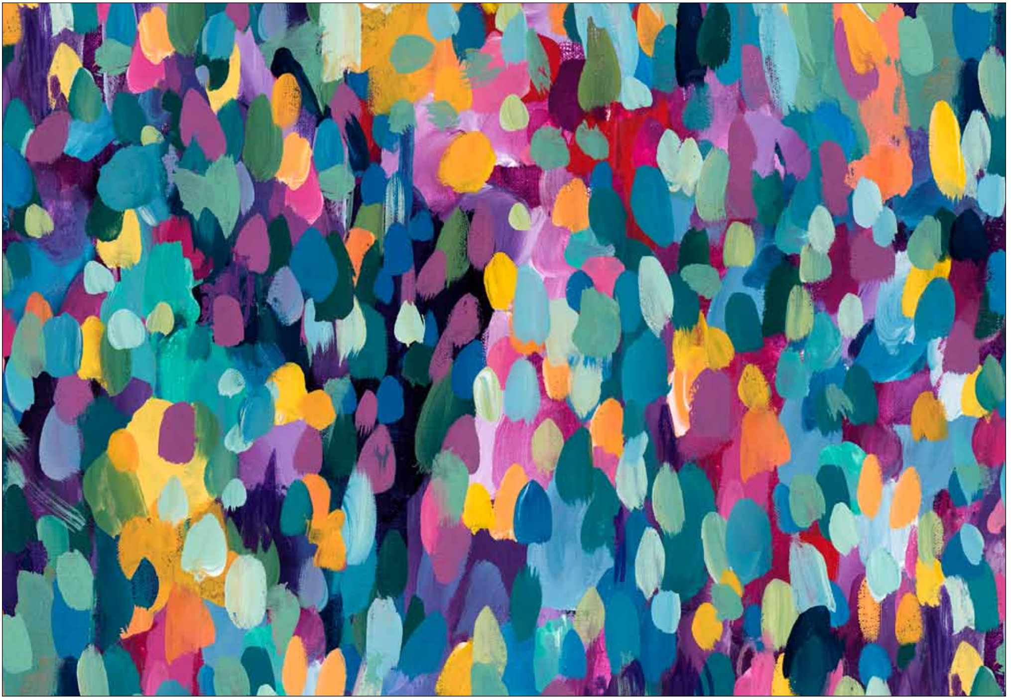
Style #AMIW Pattern #5667 BMU 100%