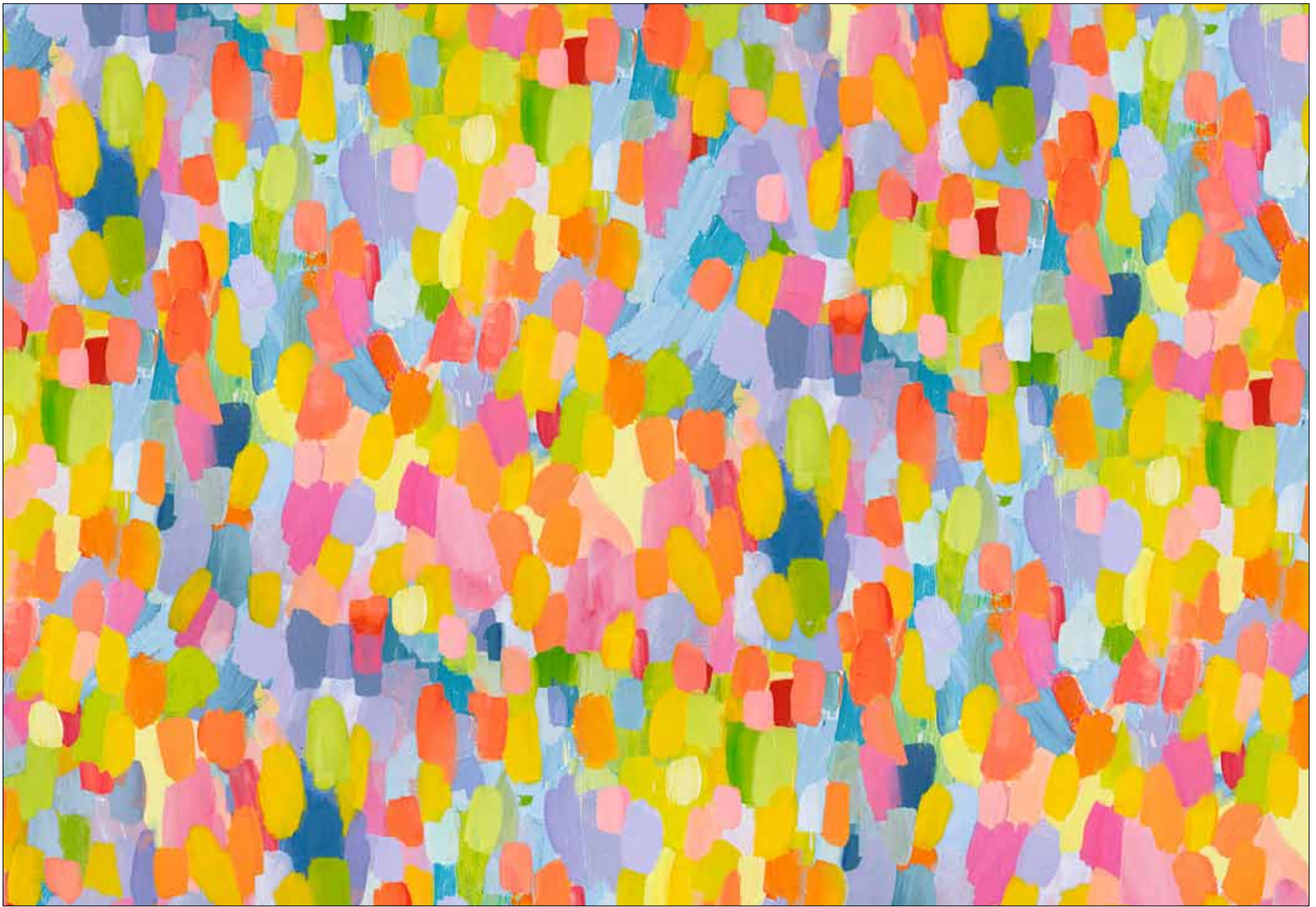
Style #AMIW Pattern #5666 YMU 100%