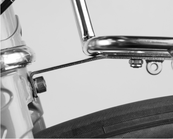
Bend is face down.

Identify a path for the strut to avoid these interferences. The 90° bend can be face up or face down.