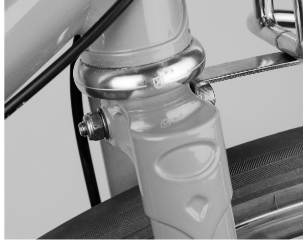
Bend is face up for cantilever brakes.

Using your hands, a bench vise, or pliers, bend the tang so it is flush with both the fork crown and the bottom of rack while avoiding any other components.