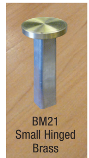
BM21 Small Hinged Brass

Compact hinged brass cover... hides 12" deep socket designed for 1 11/16" square badminton or other game posts • 4 1/2" outside and 3" opening diameter.