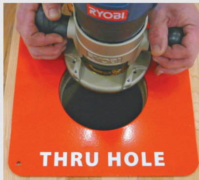
Thru Hole Template