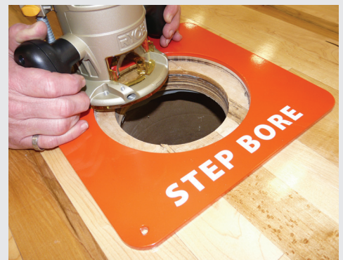
Step Bore Template