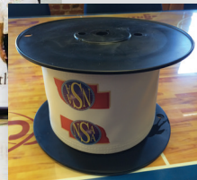
Net Band Storage Reel