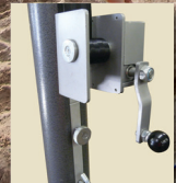
Strap Style Worm Gear Winch