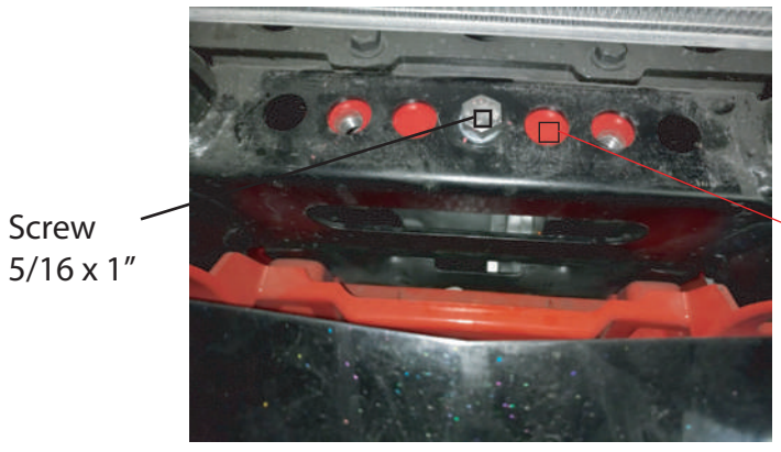
Plate with 3 perforations.

Then the plate must be located with three perforations (provided by AFX) from the inside of the plastics as it is shown in the image, then a 5/16" screws must be placed. Do not tighten yet.