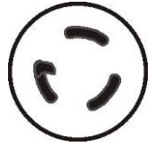
Nema L6-30 Twist