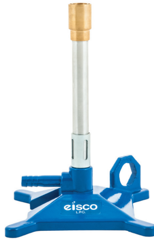
Bunsen Burner - Flame Stabilizer

CH0991LP - Liquid Petroleum Gas BTU: 2000 - 3200 | Max Temp. 1550°C CH0991NG - Natural Gas BTU: 80 - 1200 | Max Temp: 1550°C