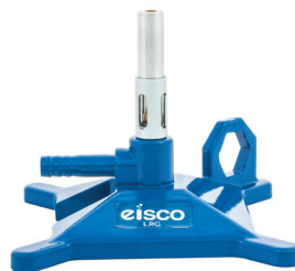
Bunsen Burner - Micro

CH0995LP - Liquid Petroleum Gas BTU: 2000 - 3200 | Max Temp. 1550°C CH0995NG - Natural Gas BTU: 80 - 1200 | Max Temp: 1550°C