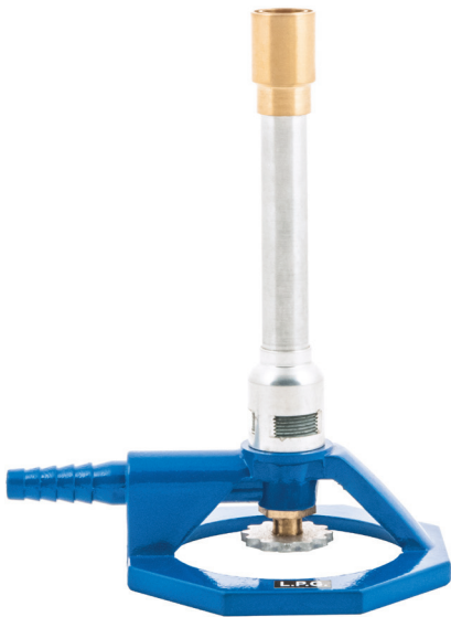
Bunsen Burner - Tirrill

CH0993LP - Liquid Petroleum Gas BTU: 2000 - 3200 | Max Temp. 1550°C CH0993NG - Natural Gas BTU: 80 - 1200 | Max Temp: 1550°C