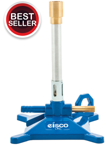
Bunsen Burner - Flame Stabilizer & Gas Adjustment

CH0992LP - Liquid Petroleum Gas BTU: 2000 - 3200 | Max Temp. 1550°C CH0992NG - Natural Gas BTU: 80 - 1200 | Max Temp: 1550°C