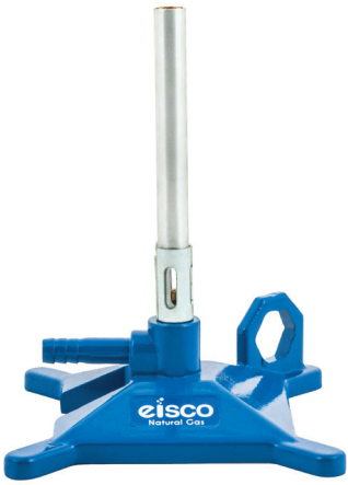
Bunsen Burner - Basic

CH0991LP - Liquid Petroleum Gas BTU: 2000 - 3200 | Max Temp. 1550°C CH0991NG - Natural Gas BTU: 80 - 1200 | Max Temp: 1550°C