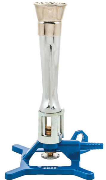
Bunsen Burner - Meker

CH0994LP - Liquid Petroleum Gas BTU: 2000 - 3200 | Max Temp. 1550°C CH0994NG - Natural Gas BTU: 80 - 1200 | Max Temp: 1550°C