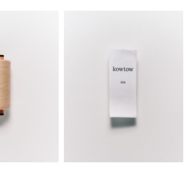
O3 COTTON LABELS