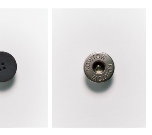
09 METAL TACK