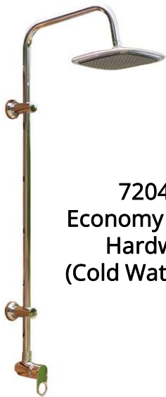
720404 Economy Shower Hardware (Cold Water Only)