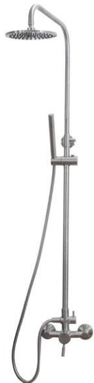
720405 Premium Shower Hardware