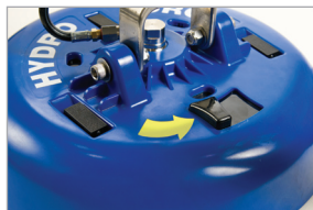
Quick change vacuum relief