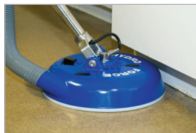
Low profile (fits under toe kicks)