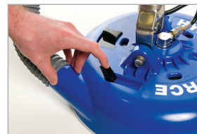
EZ-LOC™ boot (tool-less change)