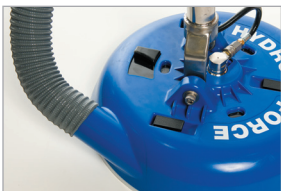
Radial vacuum line