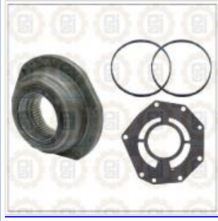
Water Pump, Thermostats and Oil Pump DT466E / 530E Oil Pumps - Oil Pumps