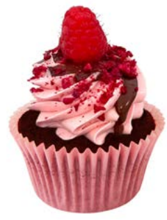
Best Dressed Raspberry Chocolate Drip 7.50

Not suitable for children under the age of 4. Egg colour may vary. Easter Special, until 1st April