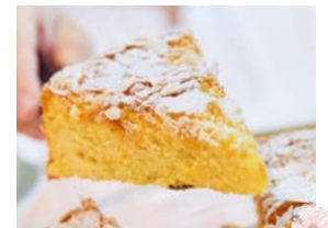
Orange & Almond