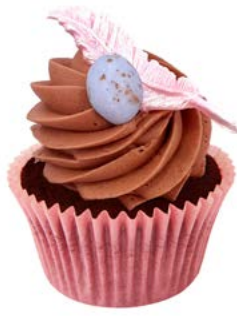
Egg-stra Special Chocolate 7.50

A final flourish of a fresh strawberry and edible petal confetti completes the look.