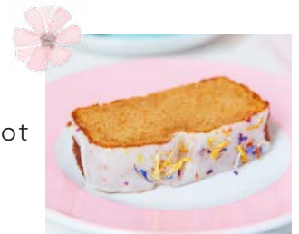
Carrot & Hazelnut

Lemon Drizzle A British classic. Zesty lemon sponge with pink lemon icing, rose petals and crushed raspberries