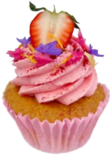
Sweet Spring. Strawberry, Rhubarb & Custard 7.50

Spring on a plate. Light and fluffy buttermilk sponge is filled with rhubarb & strawberry purée before being topped with a vanilla custard and cream cheese frosting.