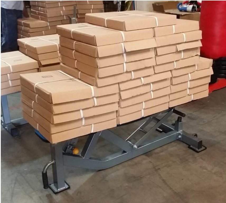
Figure: 2 Subject: View of the bench in the flat position with the distributed test load (530.40kg) applied.