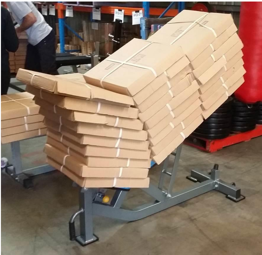
Figure: 3 Subject: View of the bench in the 30° incline position with the distributed test load (530.40kg) applied.