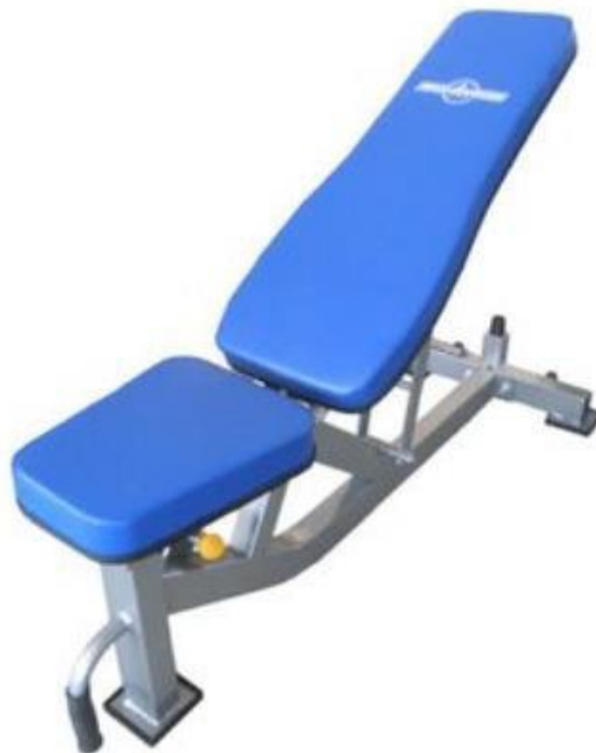
Figure: 1 Subject: General View of the AB1002 Bench.

Test Equipment: 20kg Boxed Weight Plates (Refer to Test Report 27146643-23 for details) Test Load: 530.40kg on bench (in flat and 30° incline position) Requirements: The sample is to withstand the distributed test load on the bench with no evidence of collapse or observable damage/deformation as per client's instructions. Test Results: There was no evidence of collapse or observable damage/deformation after application of the test loads. Remarks: Based on the distributed test loads applied and applying a Factor of Safety 2, the Load Rating of the Bench in the Flat and 30° incline position is 260kg.