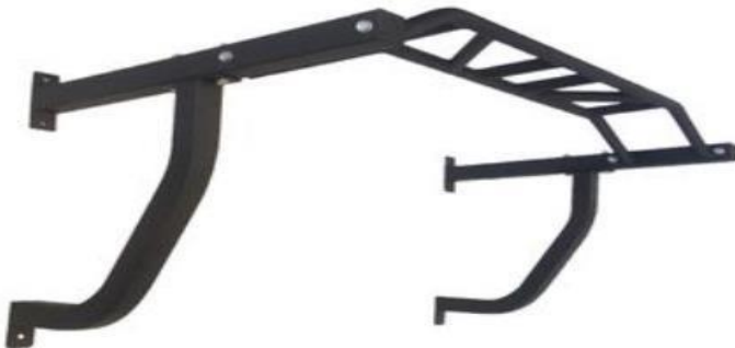
Figure: 1 Subject: General View of the 7081 Multi Grip Chin Up Bar

Test Equipment: 25kg Free Weight Plates 20kg Barbells Slings (Refer to Test Report 27146643-23 for details) Test Load: 525kg (at a span of 440mm) Requirements: The sample is to withstand the distributed test load with no evidence of collapse or observable damage/deformation as per client's instructions. Test Results: There was no evidence of collapse or observable damage/deformation after application of the test load. Remarks: Based on the distributed test load applied and applying a Factor of Safety 2, the Load Rating of the Multi Grip Chin Up Bar is 250kg