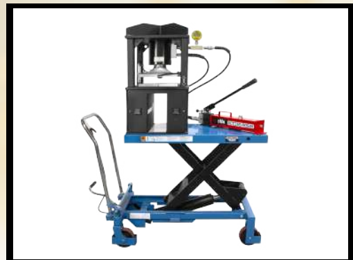
Patent No. 11,511,465