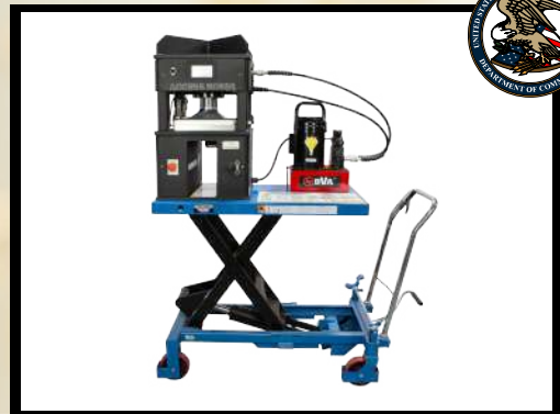
Patent No. 11,511,465