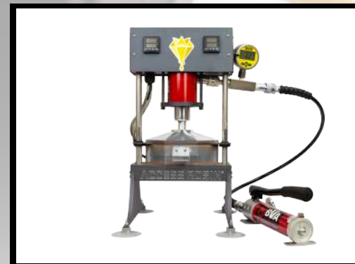
Patent No. 11,511,465