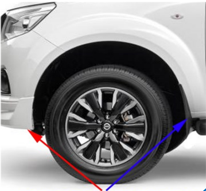
SCREW INTO REAR FACTORY MOUNTING HOLE OPTIONAL: SCREW INTO FRONT BUMPER USING SELF TAPING SCREW

See pictures on previous page for clip mounting position.