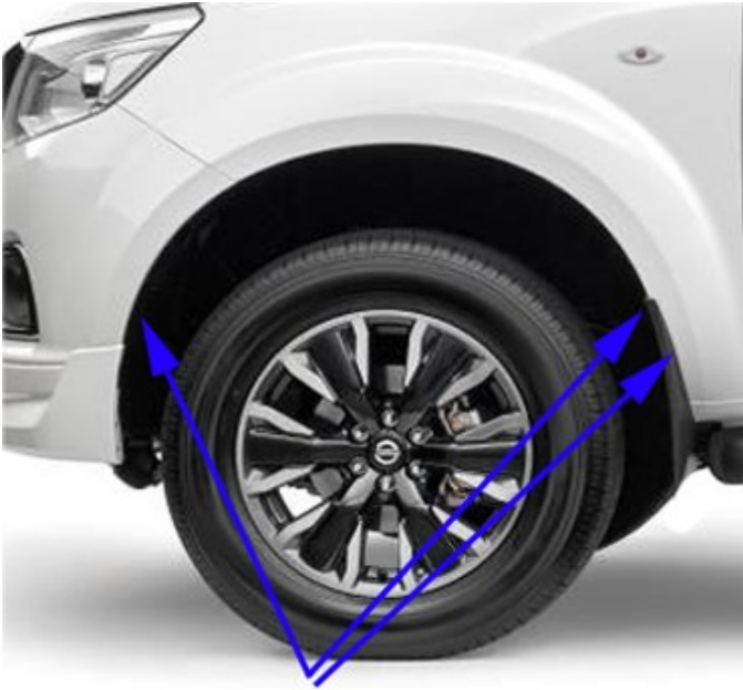
SCREW INTO FACTORY HOLES

Remove mud flaps and place fender flares on the front guards. Make sure the fender flares fit snug against the body / guards.