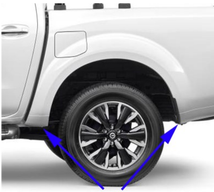
TWO FACTORY SCREW POINTS

Remove mud flaps and place fender flares on the rear guard. Make sure the fender flares fit snug against the body / guards.