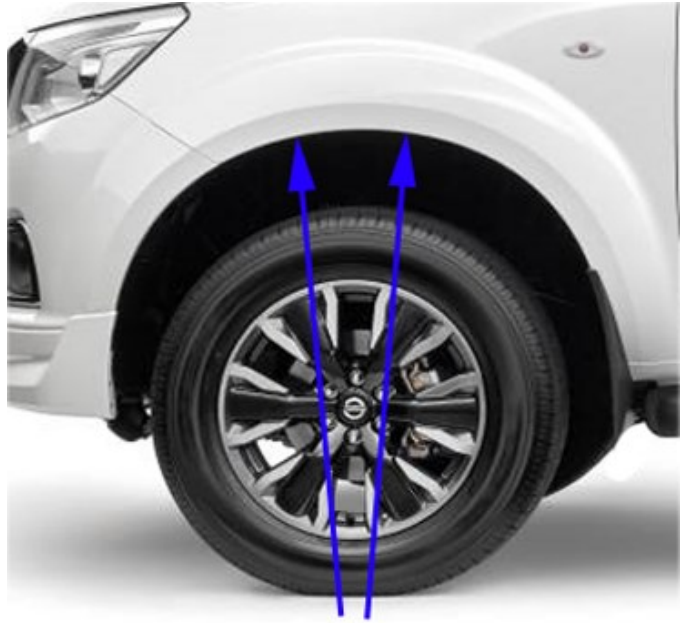
INSERT CLIPS AND SCREW INTO CLIPS THROUGH MARKED HOLES IN FENDER FLARES

(you may need to punch out the holes on the fender flares, they will be marked)