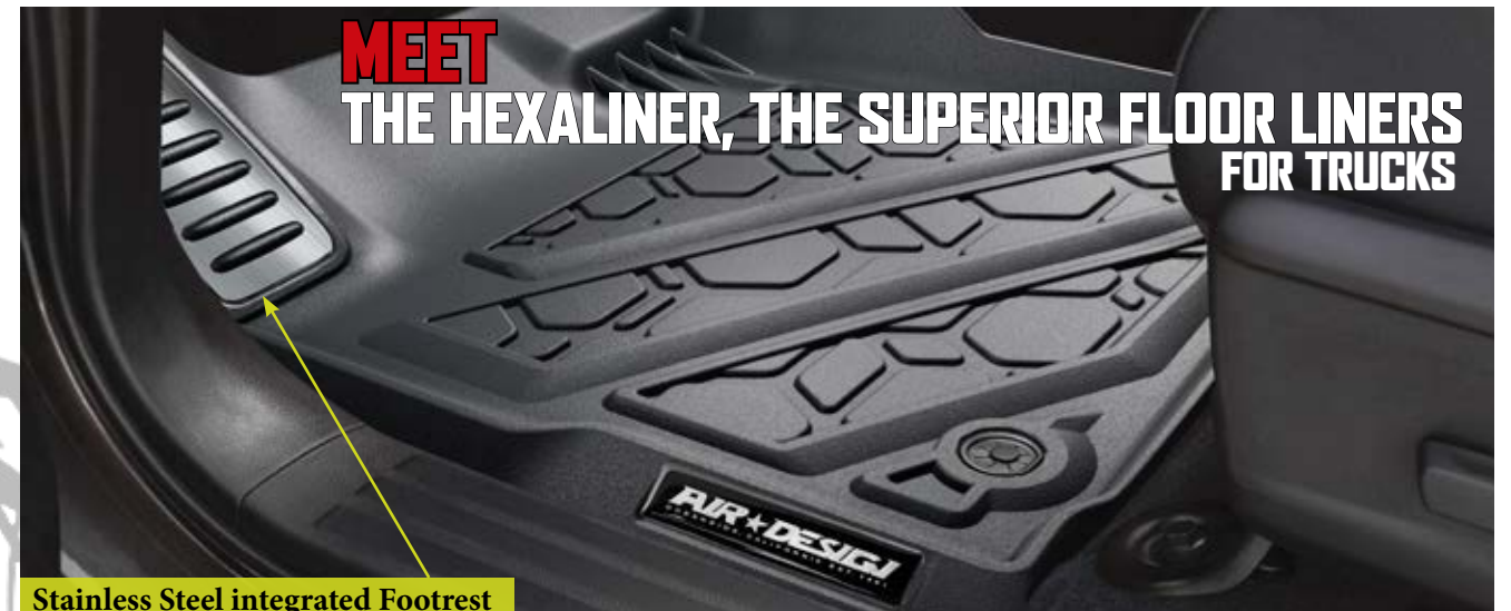
Stainless Steel integrated Footrest

Air Design's Premium Floor Liners for Trucks takes automotive carpet protection to the next level, with its exclusive Virtual Reality CAD Engineering Technology, and Industries first overlapping fit.