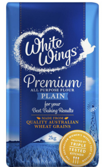
2kg Plain Flour