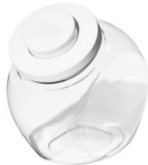
2.8L Medium Jar