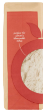
1kl Flour (2 bags)