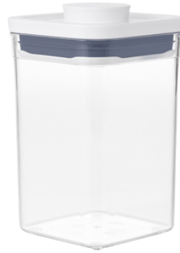
1.1 QT / 1 L Short Small