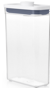
1.8L Rectangle Slim