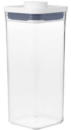
1.7 QT / 1.6 L Medium Small