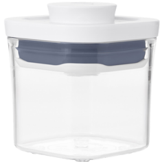
0.2 QT / 0.2 L Mini Square