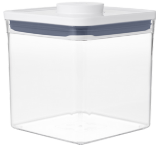
2.8 QT Short Big Square