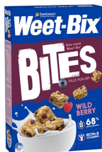
500g Cereals (2 packs)