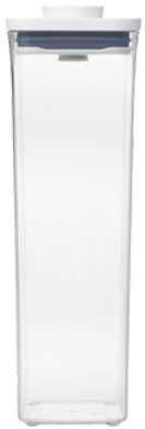
2.3QT Tall Small Square