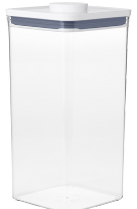
6 QT Tall Big Square