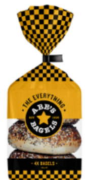
4 Pack Bagels