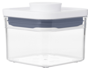
0.4 QT / 0.4 L Mini Small