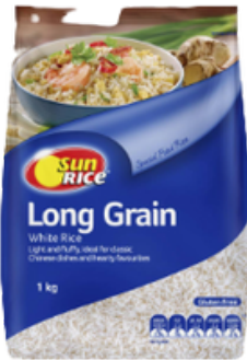
1kl rice (2 bags)