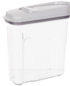
3.2L All-purpose Dispenser Medium