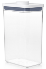
2.6L Rectangle Medium