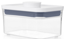
600ml Rectangle Mini