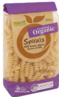
500g Pasta (2 bags)