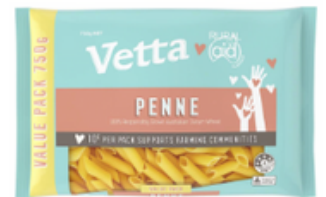
750g Pasta (2 packs)