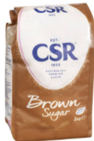
1kg Brown Sugar