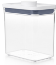
1.6L Rectangle Short