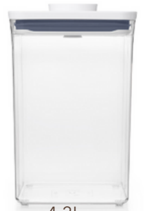
4.2L Big Square Medium