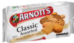
500g Cookies / Biscuits (2 packs)