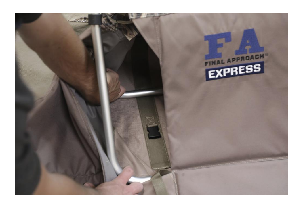
STEP 4: Attach the loop and buckles around the front of the headrest frame. This can be adjusted and won't allow the headrest frame to move around once set.