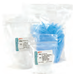
Bulk in bags, non-sterile