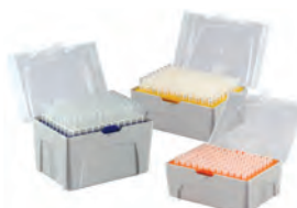
Racks, sterile; non-sterile