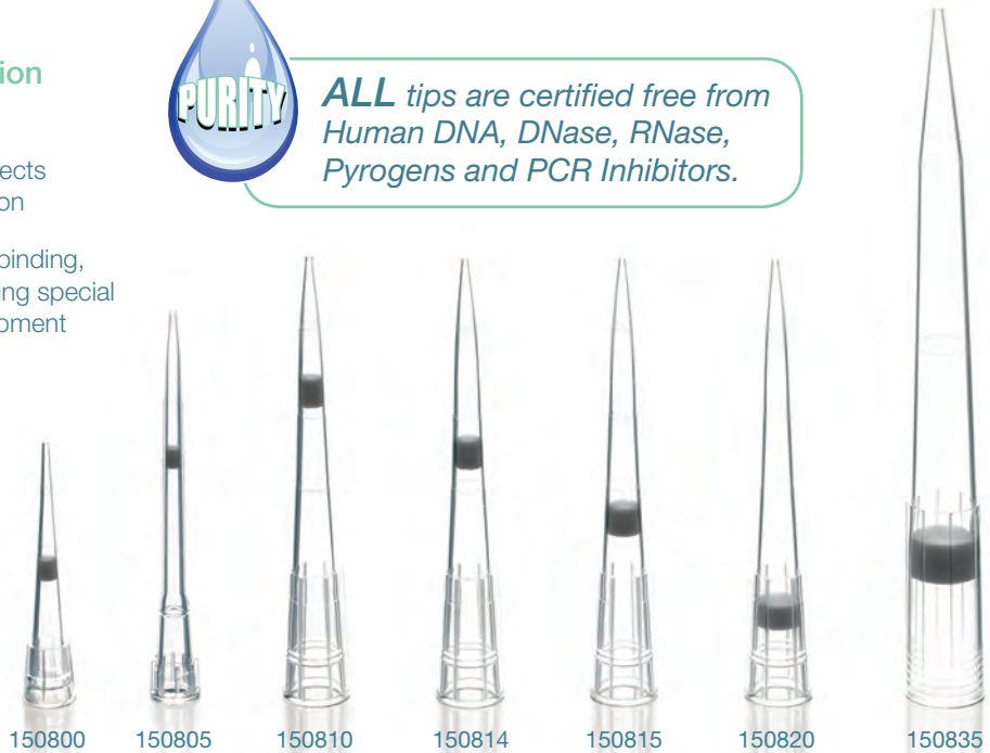
Tips shown actual size

ALL tips are certified free from Human DNA, DNase, RNase, Pyrogens and PCR Inhibitors.