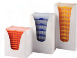
Reloading stacks, sterile