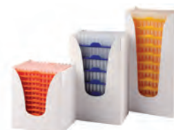
Reloading stacks, non-sterile