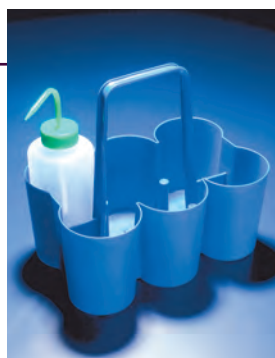
Polypropylene bottle carrier