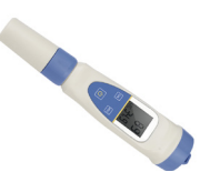
pH Meter Pen Type