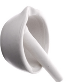
Mortar / Pestle