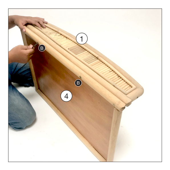
Step 1 Attach changer back panel (1) to one of the base panels (4) screwing 2 short fixing screws (B) through holes and secure with allen key (C).

Please note: Do not tighten screws fully until step 7.