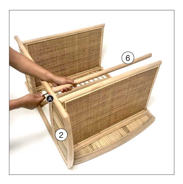
Step 5 Attach hanging rail (6) to side frame right (2) with 1 long fixing screw (A) and secure with allen key (C).