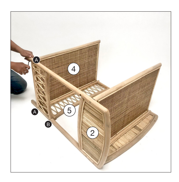
Step 4 Attach side frame right (2) to shelf back panel (5) with 1 short fixing screw (B). Attach to base panel (4) with 2 long fixing screws (A). Secure with allen key (C).