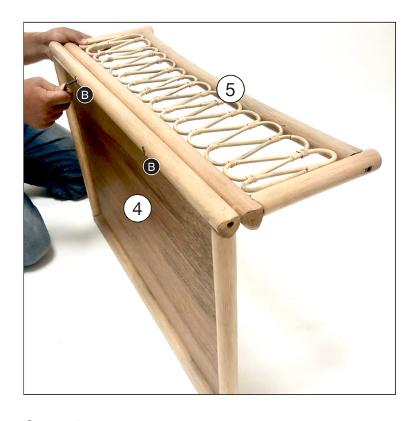
Step 2 Attach shelf back panel (5) to the remaining base panel (4) screwing short fixing screws (B) through holes and secure with allen key (C).