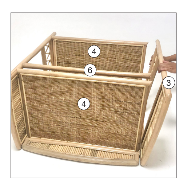
Step 6 Repeat steps 3-5 with side frame left (3), securing in place with fixing screws.