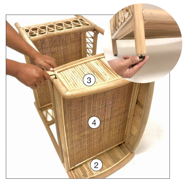
Step 7 Use allen key (C) to make sure all screws are fully tightened and secure. Rubber feet can be adjusted to keep changer level.