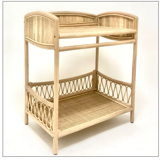
Step 8 Return changer to upright position. Add changing mat of choice ready for use.