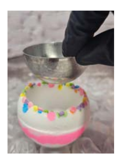
Carefully lift out the 2" Metal Mold half from the Bomb.