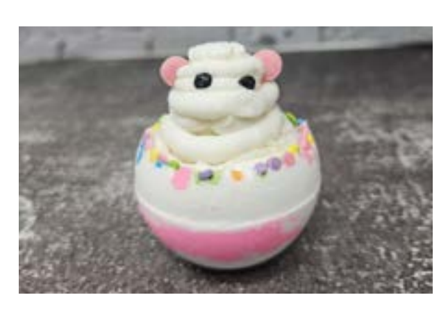
Place 2 of the Black Salt Crystals where the eyes should be.