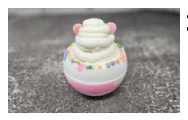
Gently Push the ears on the side of the head.