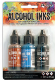
Miner's Lantern TIM20721