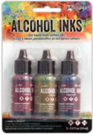
Farmer's Market TIM19763