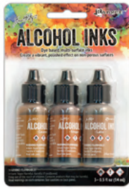
Cabin Cupboard TIM20691