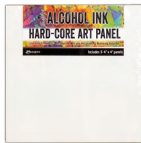
4" x 4" 3pk TAC66897