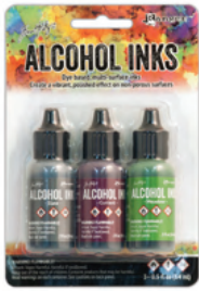
Cottage Path TIM20714