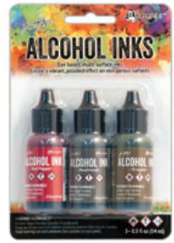
Tuscan Garden TIM20707