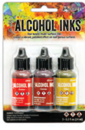
Orange / Yellow TAK69645