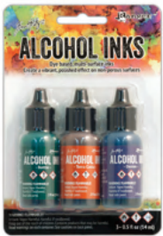
Rustic Lodge TIM19970