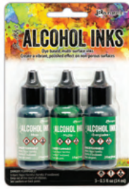
Mint / Green TAK69652