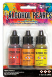
Pearl Kit #1 TANK65517