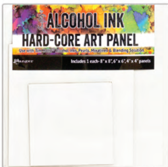
Square 3pk TAC66927