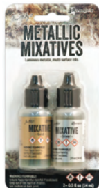
Gold / Silver TIM21247