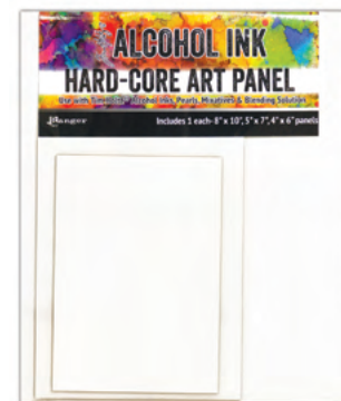
Rectangle 3pk TAC66910