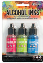
Dockside Picnic TAK25962