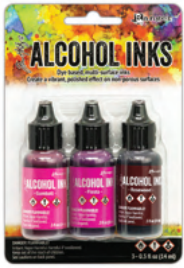
Pink / Red TAK69638