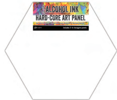
4" x 4" Hex 3pk TAC69737

Tim Holtz® Alcohol Ink Hardcore Art Panels are a versatile substrate for fine art and mixed media techniques using Tim Holtz® Alcohol Inks, Alcohol Pearls, Mixatives and Blending Solution. Hardcore Art Panels are double-sided vinyl with an Engineered-Wood-Rigid-Core MDF board offering an ideal surface that remains rigid and flat. Ready to use bright white, lightly textured surface. Available in 3 piece packs of 4" x 4" squares, 4" x 4" hexagons, and 5" x 7" rectangles. Square multi-pack includes 1 each of 8" x 8", 6" x 6", and 4" x 4" panels. Rectangle multi-pack includes 1 each of 8" x 10", 5" x 7", and 4" x 6" panels.