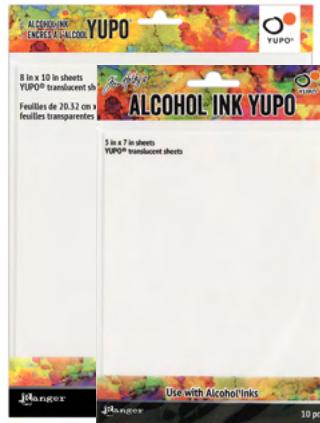
Yupo Paper 5x7- TAC49722 Translucent