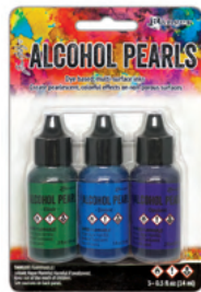
Pearl Kit #6 TANK79514