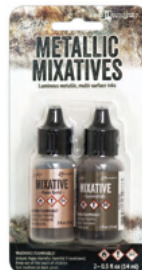
Gunmetal / Rose Gold TAK58762