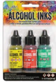
Key West TAK58748