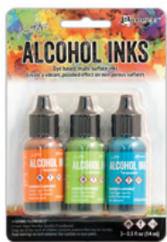
Spring Break TAK52555