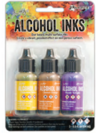
Summit View TAK25986