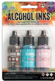
Retro Cafe TAK52562