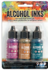
Nature Walk TIM19787