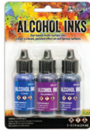
Indigo / Violet TAK69775