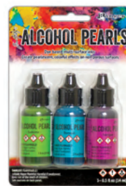
Pearl Kit #2 TANK65524