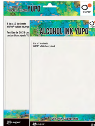
Yupo Heavystock 5x7 TAC63339 - White