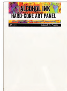
5" x 7" 3pk TAC66903