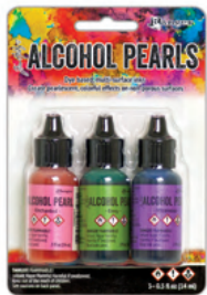
Pearl Kit #3 TANK65531