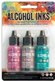
Valley Trail TAK25979