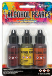
Pearl Kit #5 TANK79507