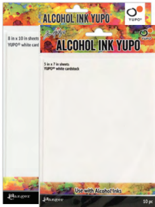
Yupo Paper 5x7 TAC49715 - White

For 8.5" x 11" Gloss Paper see Ranger Surfaces.