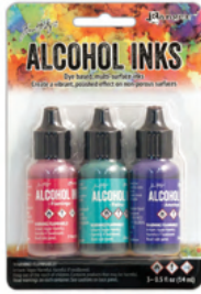
Beach Deco TAK52548