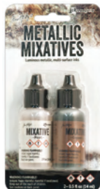
Pearl / Copper TIM21254