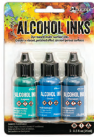
Teal / Blue TAK69669