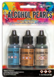
Pearl Kit #4 TANK65548