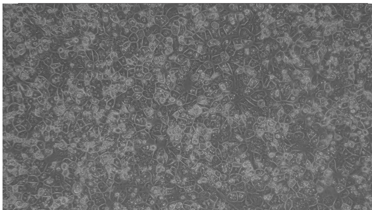
Lot _____ hours post-plating

Recommended seeding density (million cells/mL): _____ Recommended thaw medium: _____