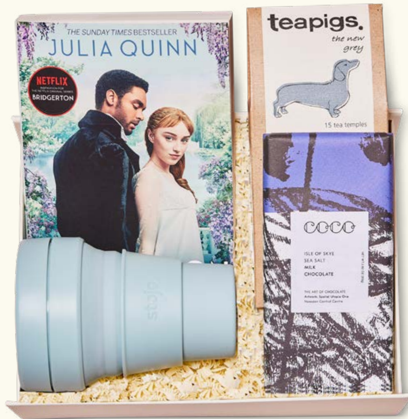
THE COMMUTE £50.00 [£47.67 EX VAT]

here are some of our most popular ready-to-send gifts.