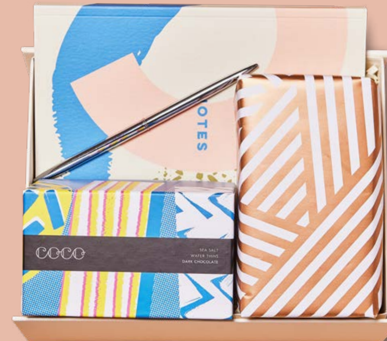
DESK GOODIES £56.00 [£46.67 EX VAT]

A5 NOTEBOOK FAST FOOD GUMMIE SWEETS A7 SIZED WATER BOTTLE MILK CHOCOLATE