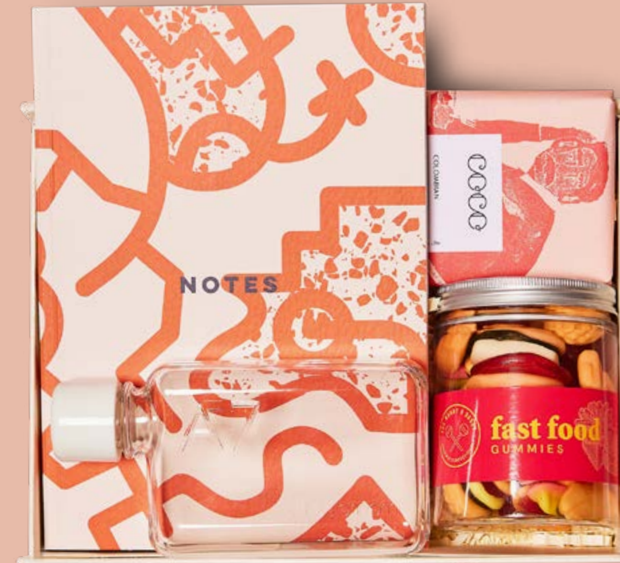
THE WFH £59.00 [£49.17 EX VAT]

COLLAPSIBLE TRAVEL CUP BRIDGERTON NOVEL SEA SALT CHOCOLATE EARL GREY TEA