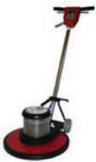
Low Speed Floor Buffer

A floor buffer machine is designed to clean surfaces including hard natural stone tiles and pavers. Rotary brushes pick up dirt from a surface, leaving a glossy, polished finish on the floor. The buffer machine consists of a handle which is connected to a horizontally rotating head. Beneath the head a large circular scrubbing pad is attached. The scrubbing pad spins in one direction and is usually electric, battery or propane powered. The type of power source will determine the maximum speed the pad can rotate and what cleaning process can be achieved. Some floor buffers contain a tank for solutions. Cleaning solution can be directly dispensed from the tank into the scrubbing pad and onto the floor. NOTE if Oxy-Klenza™ is being applied ensure that the solution tank is stainless steel or plastic as iron and other metals will be corroded by Oxy-Klenza™ because it is an oxidiser.