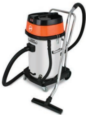
Commercial Wet/Dry Vac