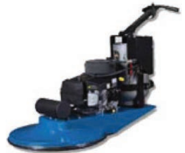
High Speed Floor Buffers