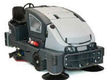
Manual Ride-On Scrubber