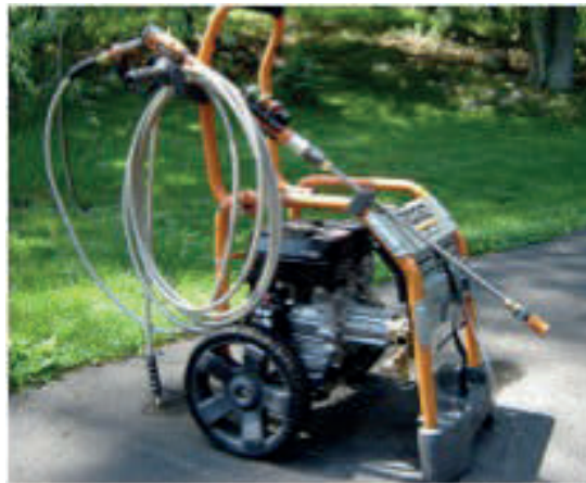
Gasoline-Powered Pressure Washer