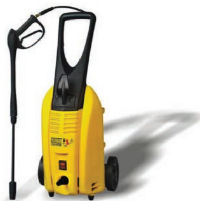
Electric Pressure Washer