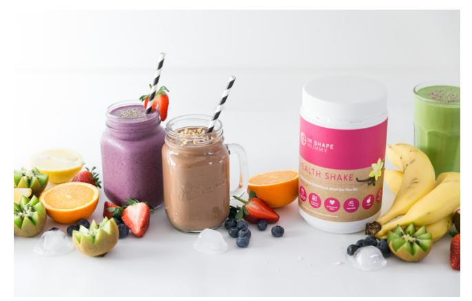
Replace 1 Meal and 1 Snack per day with an In Shape Mummy Health Shake. It costs only $3 per serve (cheaper than a latte and only takes 1 minute to make!)

Take a lunch box with you when you go out.