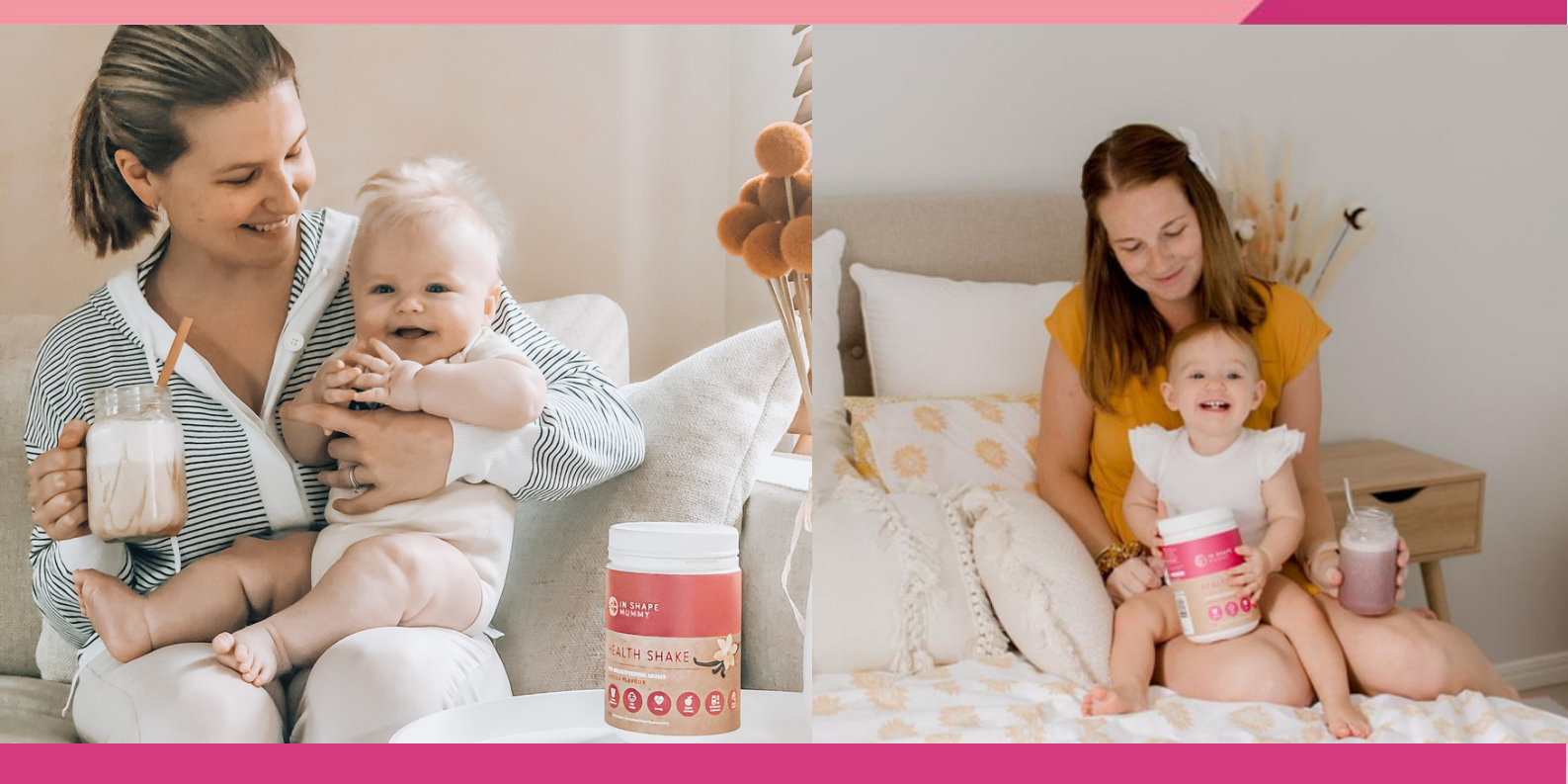
Join thousands of mums getting in shape @ www.inshapemummy.com