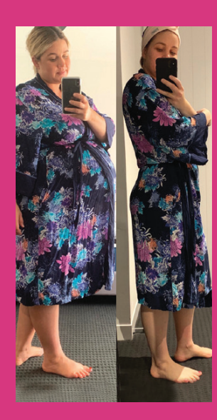
"I've lost 35 kas thanks to the In Shape Mummy Health Shakes. 110 kgs to 75 kgs! Now that I've lost the weight, I have more energy, zero aches and pains and have a better mood." Carly