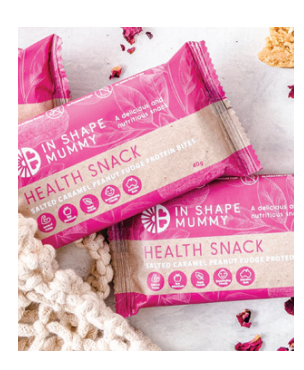
In Shape Mummy Protein Bites Salted Caramel Peanut Fudge Satisfy cravings in a healthy way to reach your doals faster.