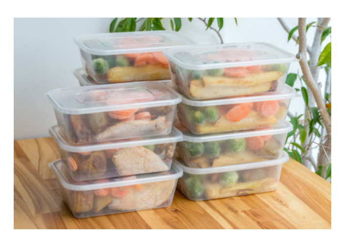
Freeze batches of meals for other days. Cook once, eat for a week.