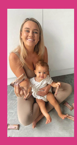
\star \star \star \star

"Obsessed with In Shape Mummy snacks because they're so quick and easy with busy mum life! And they taste delicious and increase my milk supply. What a win!" Brit