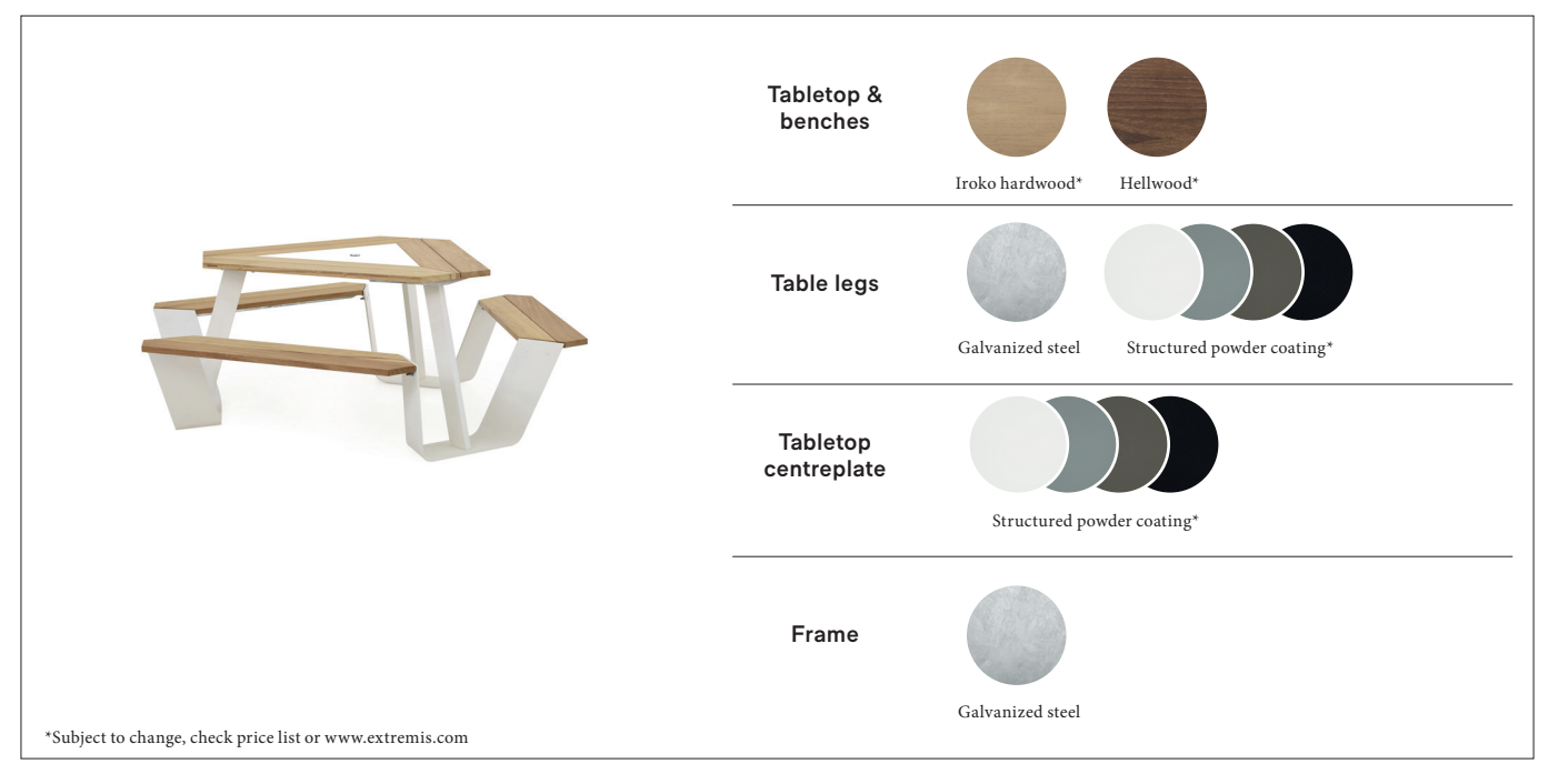
Materials & colors