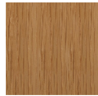
Natural Rift Sawn White Oak