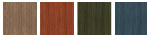
Iroko Natural Iroko Orange Iroko Green Iroko Blue