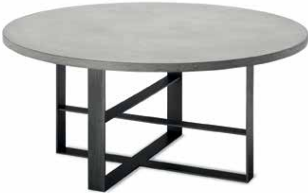
Table with steel base and concrete effect or "Alpi dark grey Oak".

Tavolo con base in acciaio e piano in effetto cemento o "Alpi dark grey Oak".