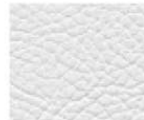
09-300 WHITE BIANCO