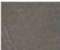
40-238 VINTAGE GREY GRIGIO VINTAGE