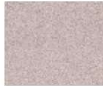
31-3417 MALVE CHALK MALVA CHIARO