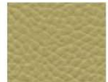
09-806 ASPARAGUS GREEN ASPARAGO