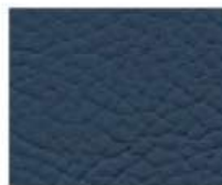
09-903 GENTIAN BLUE GENZIANA