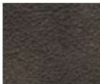
40-239 VINTAGE COAL CARBONE VINTAGE