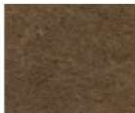
40-454 VINTAGE LEATHER CUOIO VINTAGE