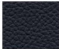
09-218 ATLANTIC GREY ATLANTICO