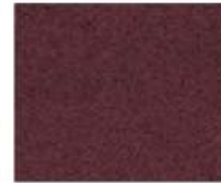
31-3424 PORT WINE PORTO