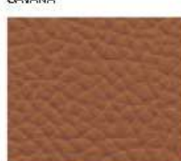
09-458 SAVANNAH SAVANA