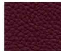
09-970 ALBERGINE MELANZANA