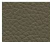
09-816 BIRCH GREEN BETULLA