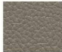
09-223 SHARK GREY SQUALO