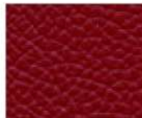
09-712 CHILI RED ROSSO CHILI