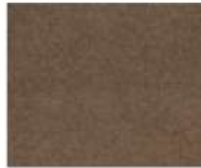
31-3406 TOBACCO TABACCO