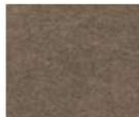
40-632 VINTAGE TERRA TERRA VINTAGE