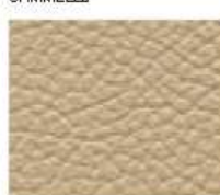
09-513 CAMEL CAMELLO