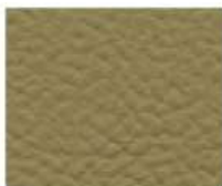
09-813 AMBER GREEN VERDE AMBRA