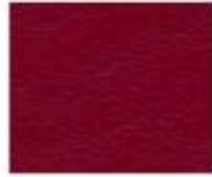
07-712 CHILI RED ROSSO CHILI