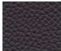
09-217 HIPPO GREY IPPO POTAMO