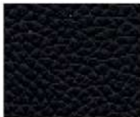
09-010 BLACK NERO