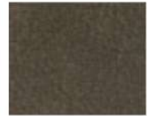
31-3409 PUCE BRUNO