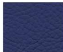
09-904 INDIGO INDACO