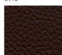
09-610 COFFEE BROWN CAFFÈ