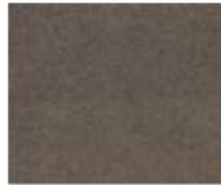
31-3416 FOSSIL FOSSILE