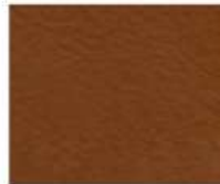
08-445 DARK TAN CUOIO SCURO