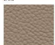
09-621 DEER BROWN DAINO