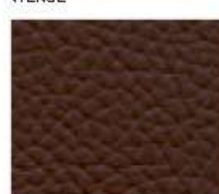
09-603 WENGE WENGE