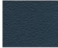
07-907 MEDITERRANEAN MEDITERRANEO