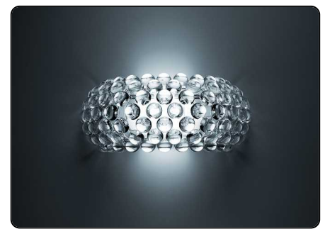
value and functionality.