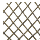
Flat Trendyrope Cocoa mix