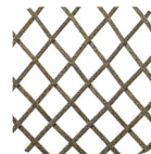
Flat Trendyrope Cocoa mix