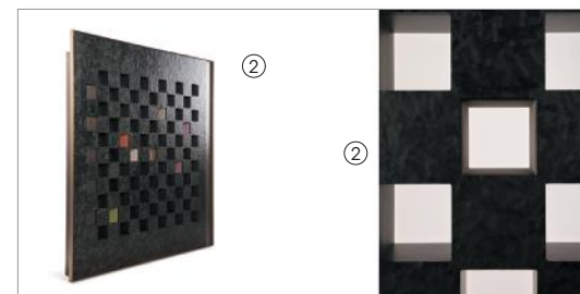
2 The Cabinet of Memories 12018+12012