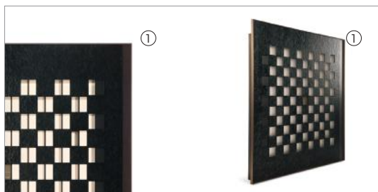
1 The Cabinet of Memories 12018