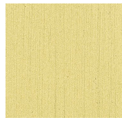
Ottone satinato Satin brass