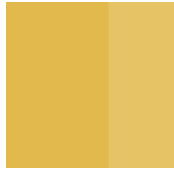
Ottone lucido Bright brass