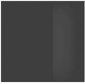
Cromo nero Black chrome