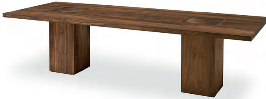
Table with top made of solid wood in glued lists, characterised by legs passing through the top surface, made from sections of tree trunks. Version with rectangular top and two legs.