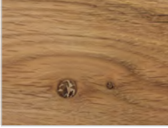
oak with knots