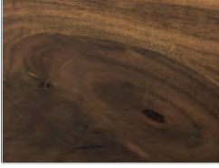
walnut with knots