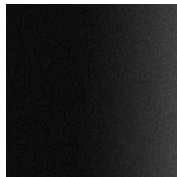
101 FT Black fine textured