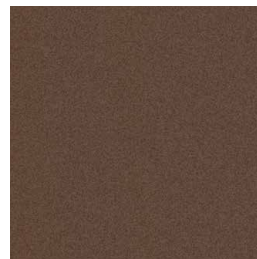
108 FT oxide fine textured