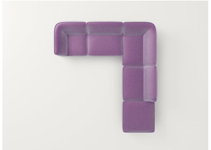
B33AS + n°2 B33H + B33ES + B33G