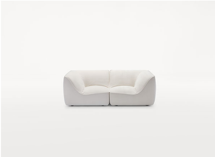
B33AS + B33AD