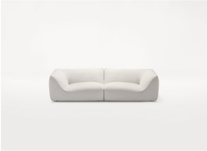
B33ES + B33ED