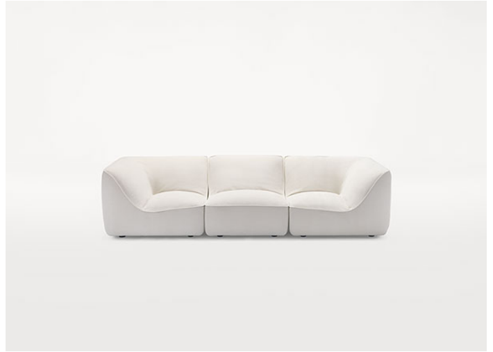
B33AS + D33B + B33AD