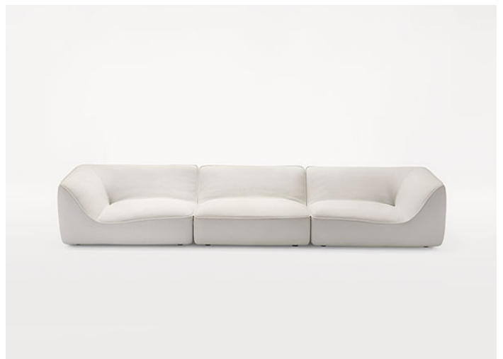
B33ES + B33H + B33ED