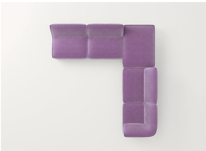
n°3 B33H + B33F + B33AD