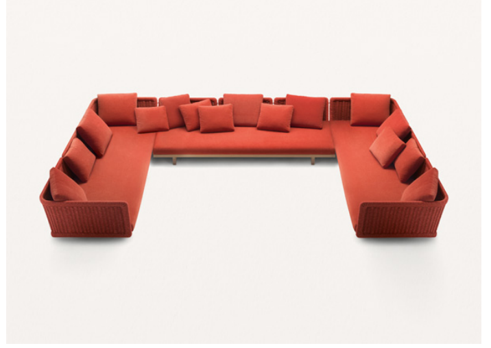
n° 2 B39B + B39F