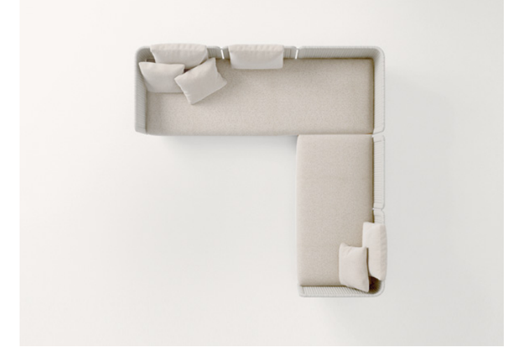
B39B + B39CD