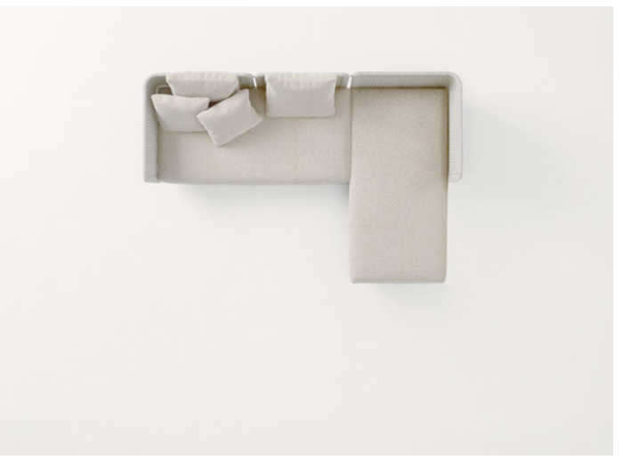
B39CS + B39NS