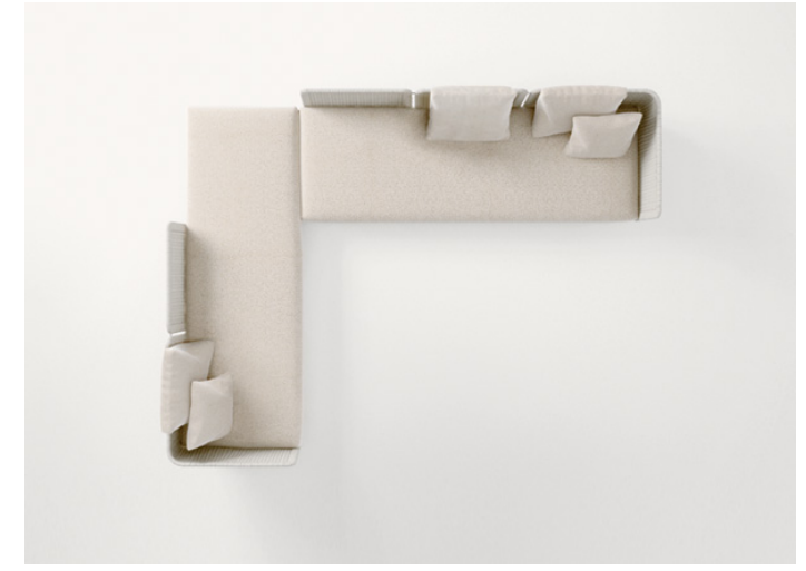
B39MS + B39ED